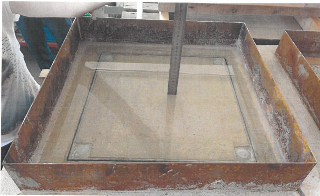
Figure 1: Watertightness test set up - ACO Access Cover UNIFACE 300x300x70, EI120